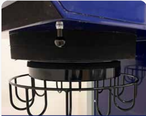
HOOK FOR CONTINUOUS BAG