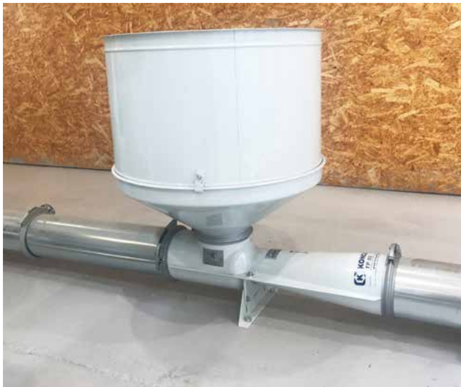
The TF Injector with optional hopper and hopper extension are shown above

equipped with a nozzle sized to the TRL blower it is designed for. TF 20 is used in combination with TRL 30 (60 Hz), the TF 40 is for TRL 50 (60 Hz) and TF 55 is used for TRL 100 (60 Hz).