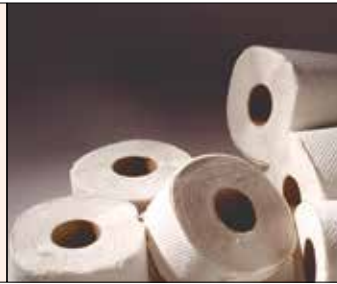
Off-cuts from the production of tissue products