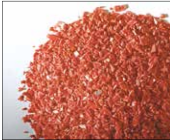
| Recycling of granular plastic rejects

Kongskilde specializes in the conveying, compaction and cleaning of process waste within the paper, plastics and packaging industries, thus giving your company direct access to trade-oriented know-how on process material handling.