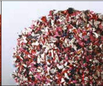
| Plastic waste processed into flakes