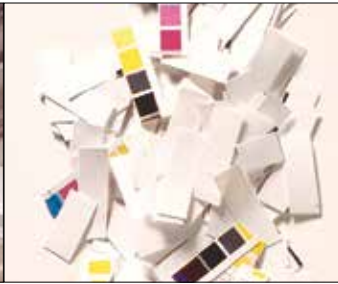
Trim cut from paper and film production machines