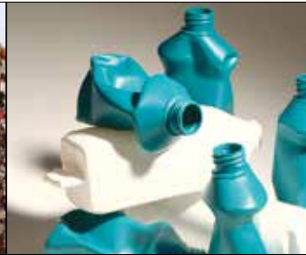
| Finished plastic items. Both approved items and rejects for recycling