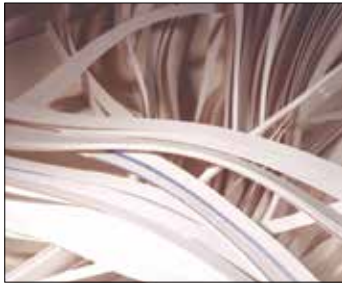
Continuous trim from the cutting of paper and film rolls.