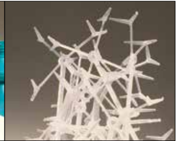
| Sprues, top and tails for recycling