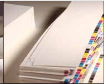
Off-cuts from clean-cutting in the graphic industry