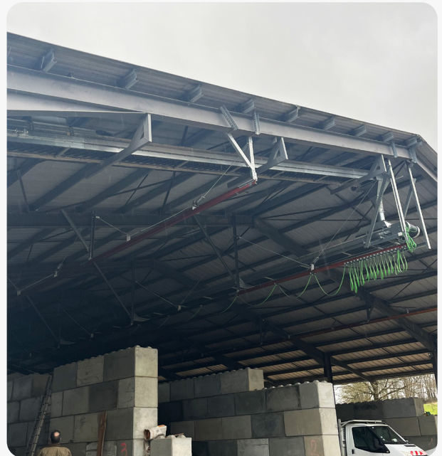
Grain intake from outside the building is routed at roof height.

Installed at roof ridge height, the system maximizes the available storage volume beneath it, enabling full use of the 7,000-tonne capacity for the first time.