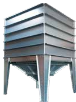
Clean Silo 200-300

and C-300 are available with 45° and 60° cone. Outlet flange is 300x300 by 45° cone and 500x500 by 60° cone.