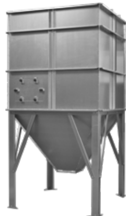
Clean Silo 100-150

The bottom cone of C-100, C-125 and C-150 is 60° with an outlet flange of 300x300mm. C-200, C-250