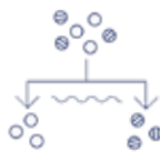
CLEANING AND SEPARATION